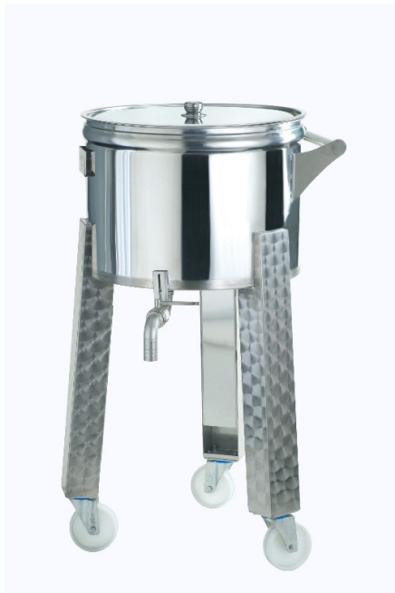
Tall Version mobile tank