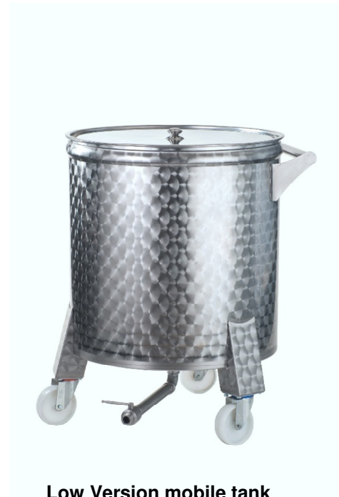
Low Version mobile tank